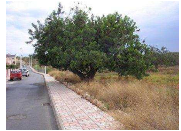
A Piece of History?

This Carob Tree is reckoned to be 250- 300 years old. It is unfortunately unsafe and although we would like to save it, the probability is that it will have to be removed.